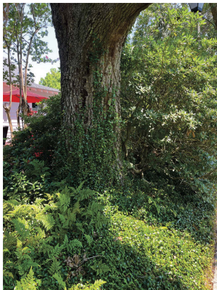
Creeping fig, climbing fig, figus pumila , is aggressive and left unattended can take over. LSU Ag Center states in "Ground Covers & Vines for LA Landscapes" that it grows 60' in height and of no major landscape value, except for covering walls.