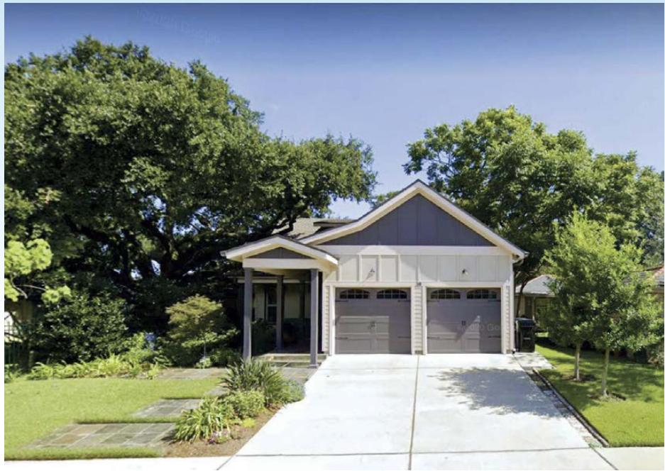
Perfectly executed seven year old new home built under two majestic oaks.

If you have a mature lane oak in conflict with another tree or palm, call a professional to remove the tree or palm causing the conflict with the oak.