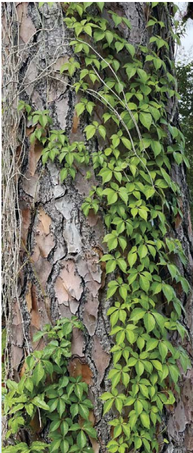
Virginia Creeper on pine. LSU Ag Center states in "Ground Covers & Vines for LA Landscapes" that it grows to 50' in height and of no major landscape value.