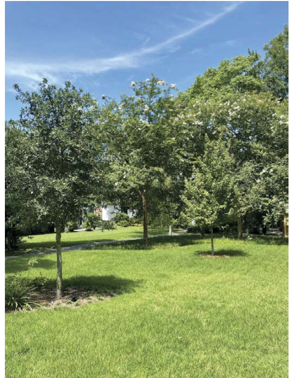
Two homeowners on Poppy Lane planted container grown trees. One tree is a beautiful young Live Oak and the other a Maple.