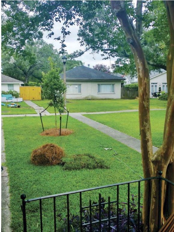
A young container grown Savannah Holly was recently planted in a front yard on Althea Lane.