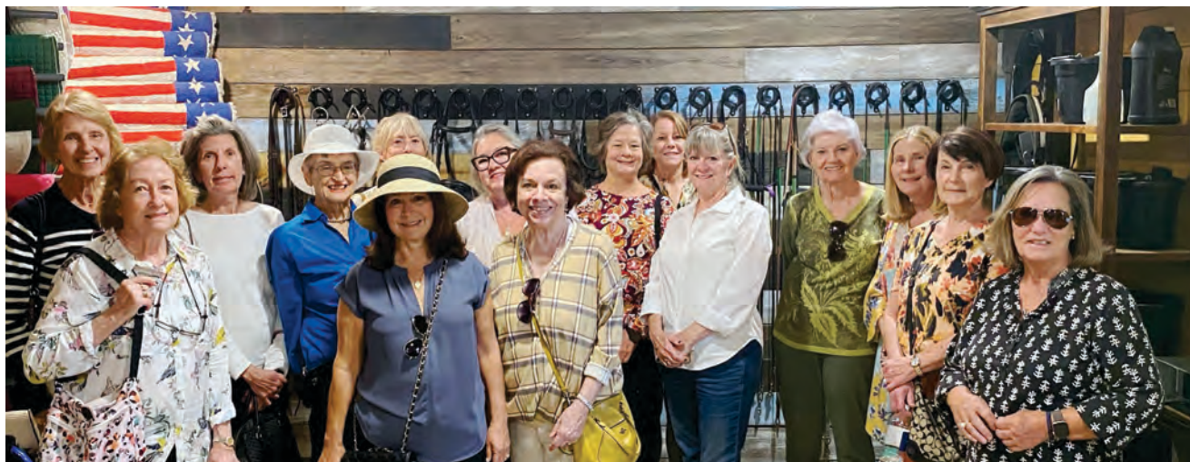
Good turn out at New Heights Equine Therapy